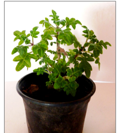
New plant of Iboza for a partnership

Iboza , name of the genus taken from a Zulu language.